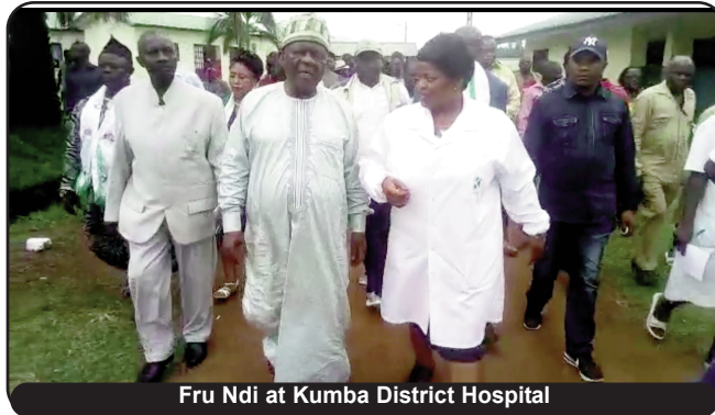
Fru Ndi at Kumba District Hospital

Refusing to wrestle with the DO, Ni John Fru Ndi concluded that by denying him access to see the burnt section of the oil refinery, the government was trying to hide a dubious incident in connection to the fire incident.